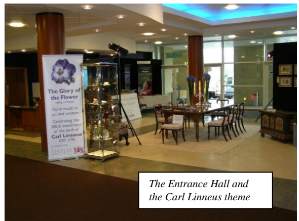
The Entrance Hall and the Carl Linneus theme