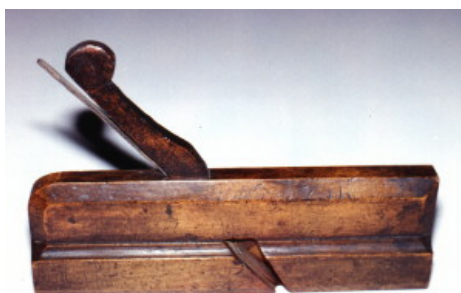
Image 3. Shown left is a superb example of a very early plane (possibly even 17th C.). Again the wide flat chamfers & early long shaped wedge. The plane has been shortened at both ends, as chamfers are not as wide there.