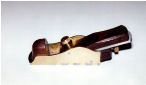
Image 12. New quality adjustable block plane by Karl Holtey with steel sole dovetailed to gunmetal sides and very nice rosewood infill and thick parallel blade. Just simply the best modern plane money can buy.

worth mentioning who are making copies of early Norris planes of outstanding quality in gunmetal and steel. Karl Holtey's planes are the best modern planes money can buy. Some people believe that they are actually better than the originals and I wouldn't argue about that, though at prices ranging from £1000 to £2,500, they are not within many craftsmens' reach. (Photo 12.)