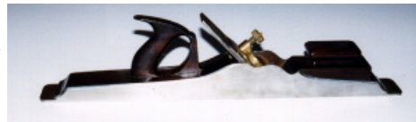
Image 5. A very rare 25 1/2" long dovetail steel jointing plane by Mathieson. It has a gunmetal cap and a very good nicely gained rosewood infill. Pretty heavy but a joy to use. Long wood filled jointing planes such as this are few and far between and command high prices.

It wasn't until the mid-19th century that steel started to be used as the basic material for plane making. Stewart Spiers is widely recognised to have been the first manufacturer of steel planes in Britain, starting his business in 1840. (Photos 6 and 7.) Spiers' original ideas were copied by Mathieson and improved upon by Thomas Norris. It was at this time that Britain produced some of the finest quality tools ever made.