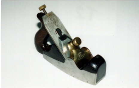
Image 9. Early Norris smoothing plane. Dovetailed coffin shape No A2.

Only the earliest Norris planes had rosewood infill like this—most found today have beech infills.