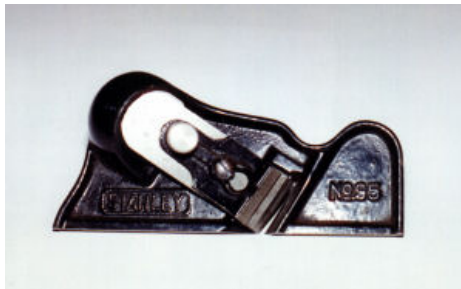
Image 11. A more unusual Stanley (USA) No 95 edge trimming plane. Initially used for truing up man-made boards before veneering.

Due to the shape of the back not many survive damage because of being dropped.