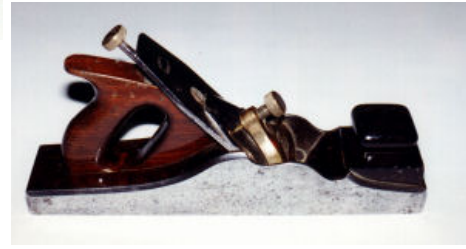
Image 8. Good early Norris of London 13 1/2" long dovetail steel plane. One of the best planes ever

Basically rubbish compared with most Spiers planes but its rarity would command four figures at auction today.