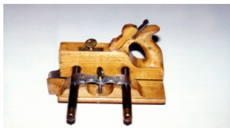
Image 4. A rare beech bridal plough plane with ebony arms by A. Mathieson & Son, Glasgow & Edinburgh. One of the best quality plough planes Mathieson made; they only commercially made one better.

discover that the earlier, longer planes stuck out further on the shelf. The answer to this problem was easy-he just shortened the older ones to match! Unfortunately for us today, it means that many early planes are without a maker's name; the front, where the maker's stamp would have been, has been removed. The moulder in picture 3 dates back to the early 18th century and has been shortened both at the front and back, but displays many period features, including the large wedge and flat chamfers. You can see the similarities with the Wooding moulder in photo 2.